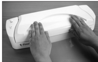
Press and Release Lid